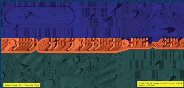
Union Linear City Planning Unit